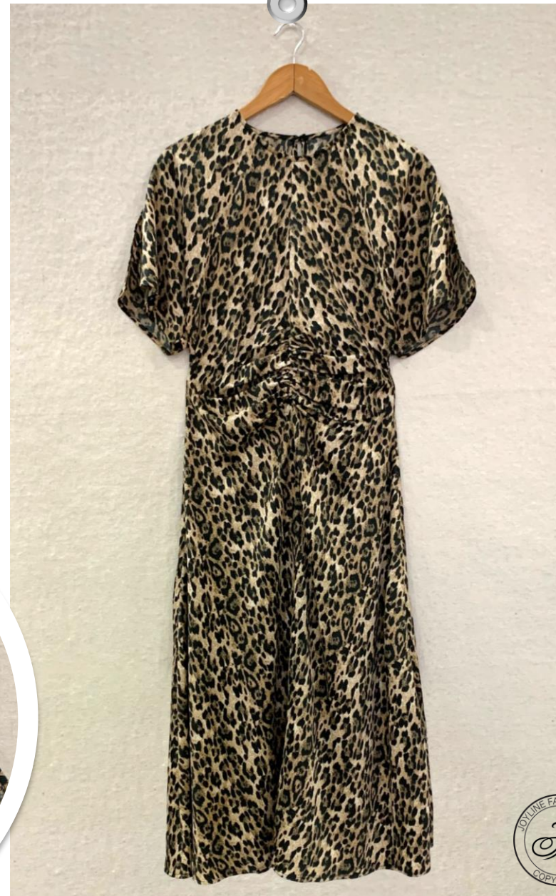
#RUCHED DRESS Poly Crinkled Satin