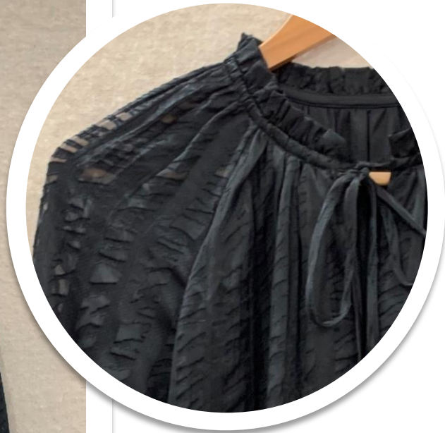
#AMBER-21 Burnout Satin (imported)