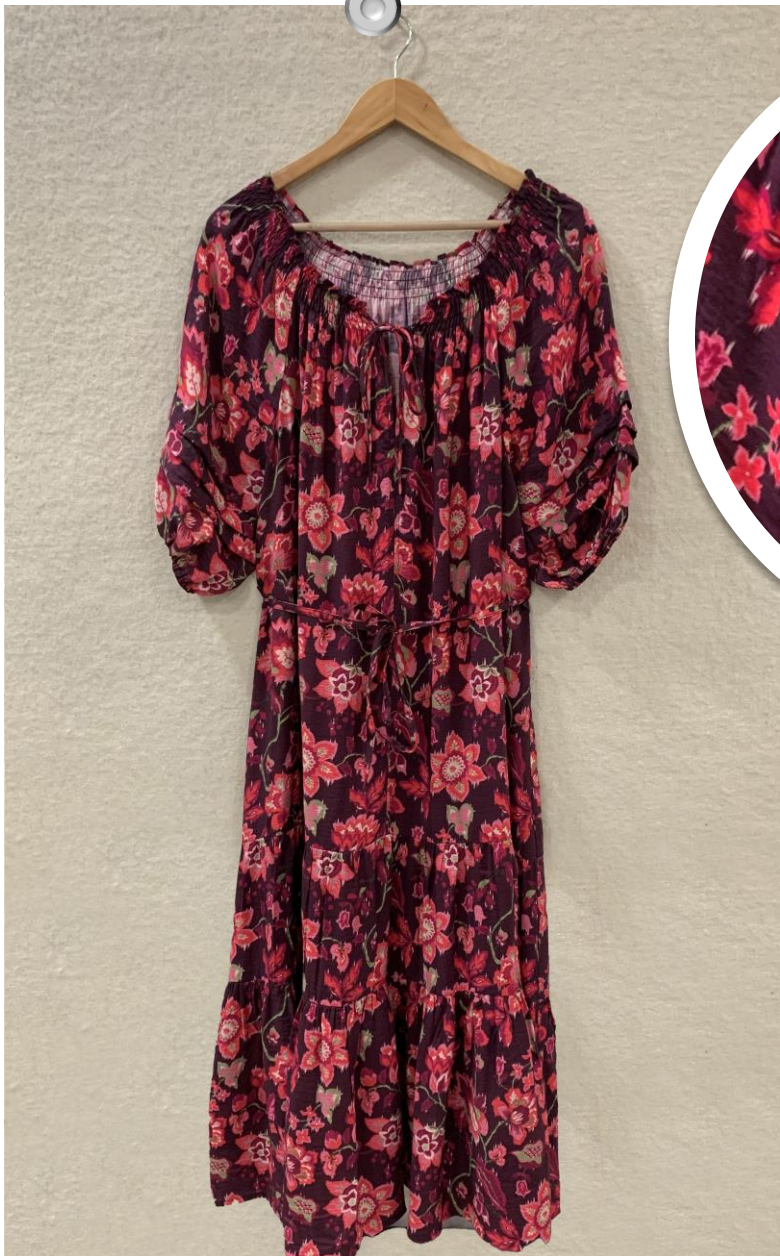
#AMBER-111 Viscose Nylon Printed