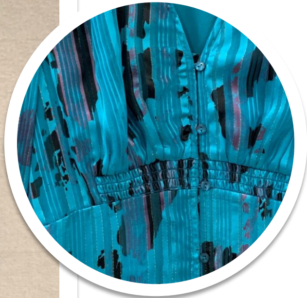
#AMBER-09 Poly Lurex Satin Stripes