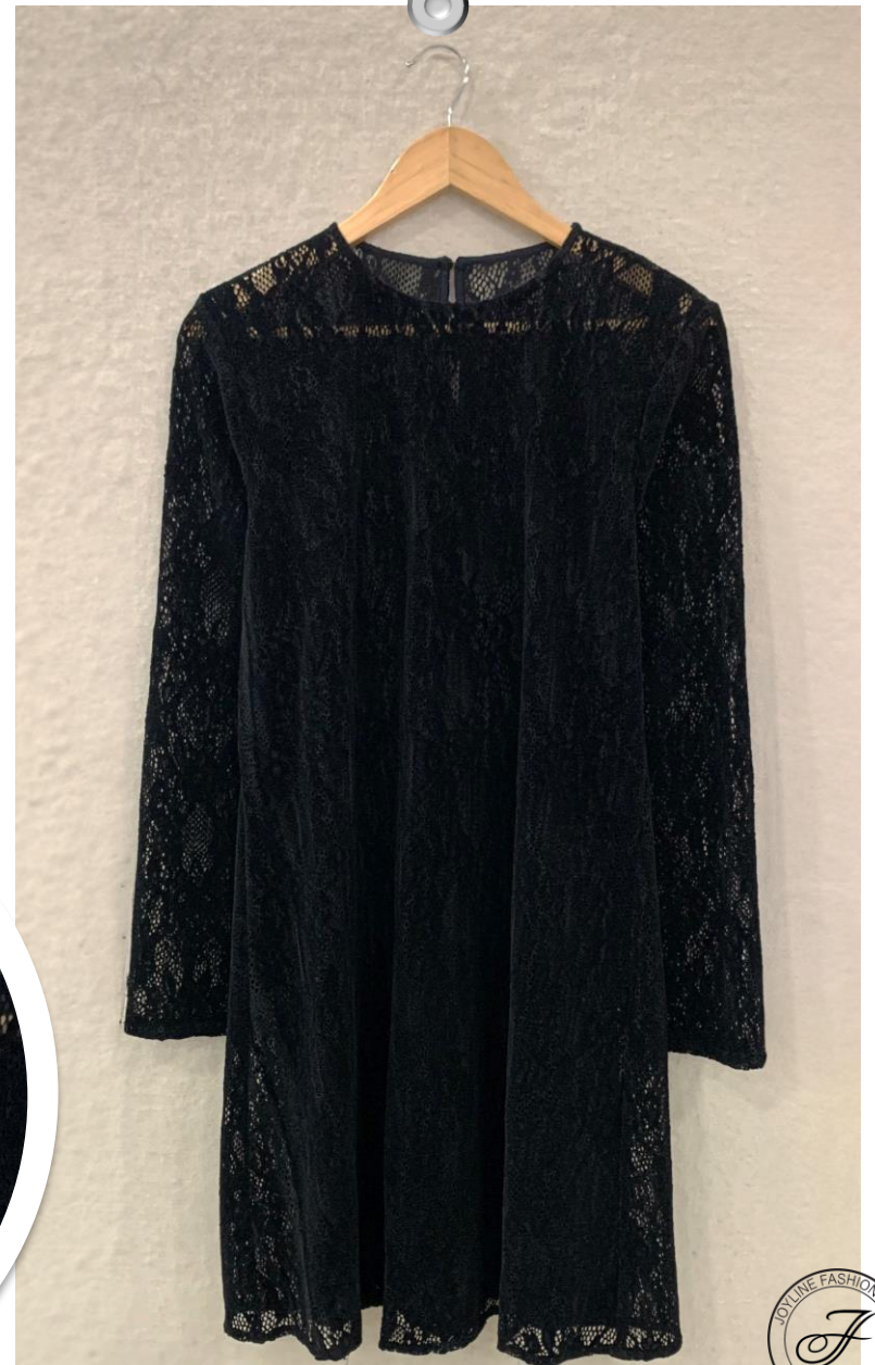
#AMBER-33 Flock Lace (imported)